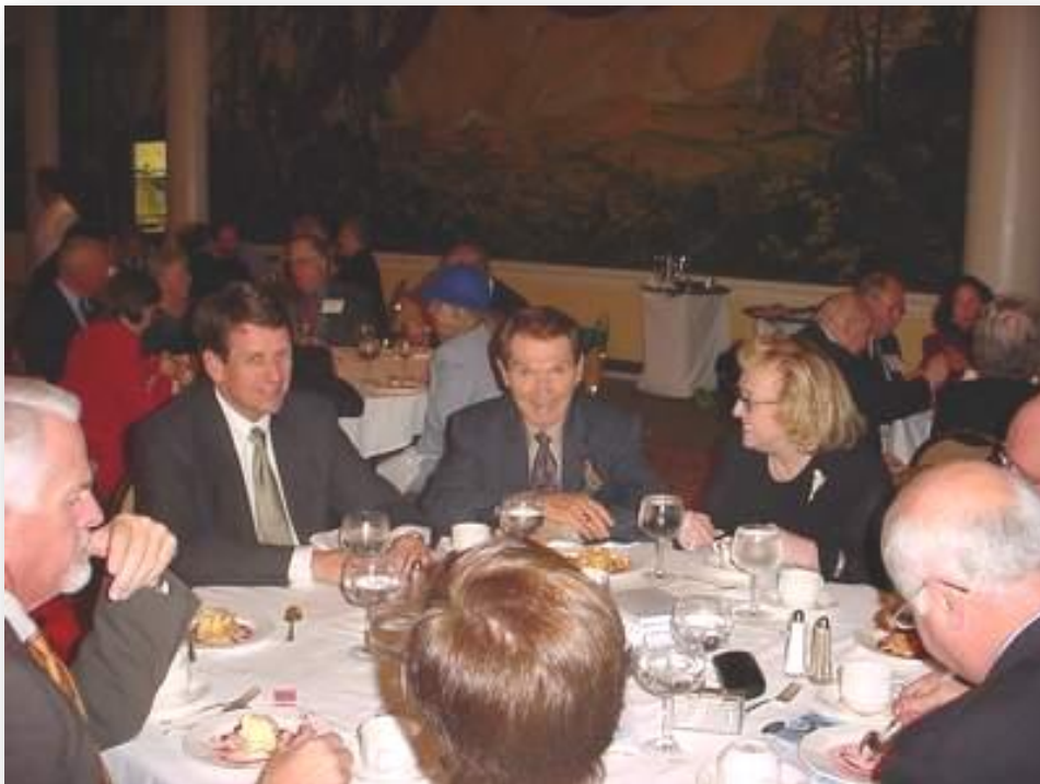
Michael Farris ( HSLDA ), Tim LaHaye and His Wife, Beverly