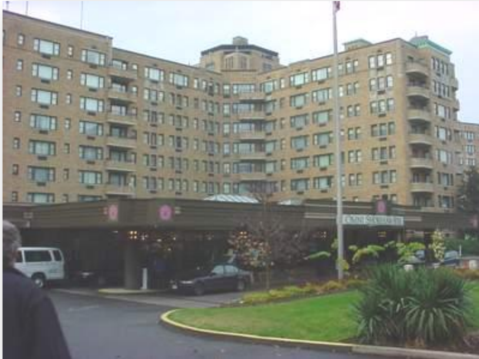
Front Exterior, Omni Shoreham Hotel, Washington, D.C.